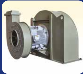
Alternator Blower with Exhauster