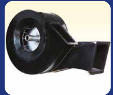
Traction Motor Blower