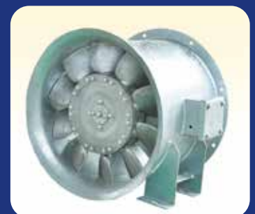
EDC - RE - Cooling Fan

WE SPECIALISE IN THE DESIGN & DEVELOPMENT OF CUSTOMISED FANS FOR SPECIFIC RAIL APPLICATIONS