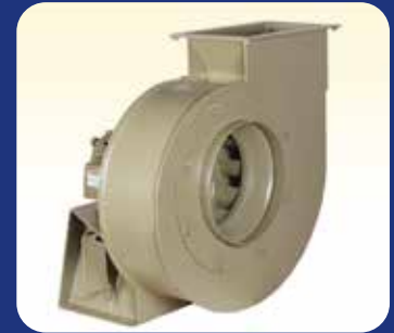
Centrifugal Exhaust Blower