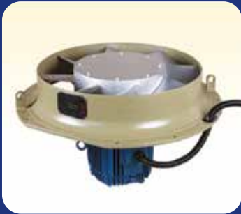
Axial Fan with Fixed Blade Impeller

An exclusive unit is dedicated to the design, development and manufacture of axial / centrifugal fans and metal spinning components for the railway application.