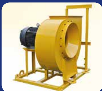
Dust Extraction Blower