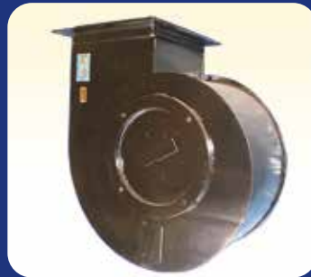
Dust Bin Blower